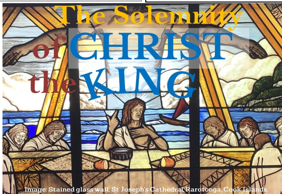
Image: Stained glass wall, St Joseph's Cathedral Rarotonga, Cook Islands